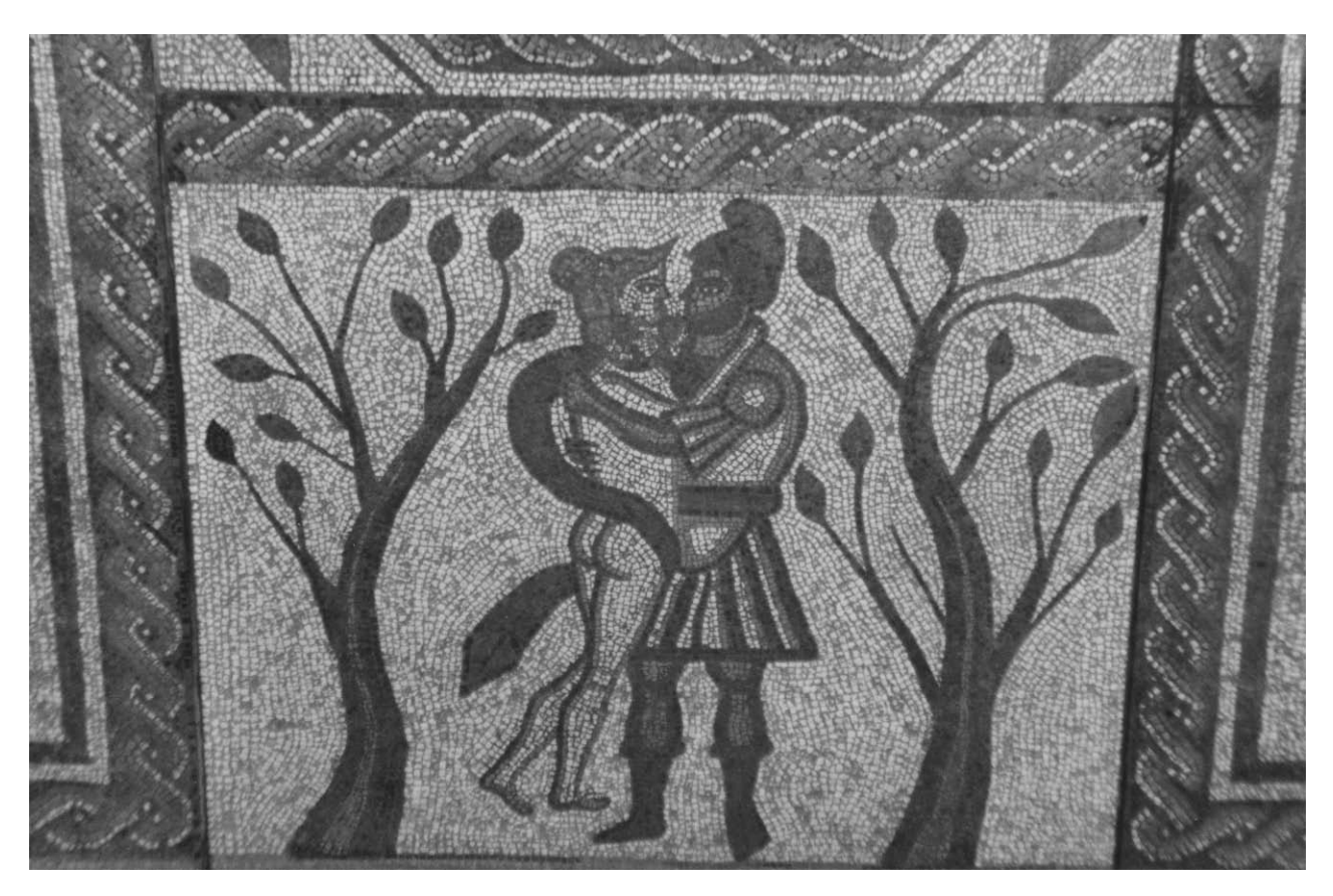
Fig. 5 — Low Ham (Somerset). Part of the mosaic floor depicting events described in the fourth book of the Aeneid; here Aeneas and Dido embrace.

mosaic at Low Ham, Somerset, which depicts scenes from the fourth book of the Aeneid (Fig. 5; Henig 1995, 120-1), and an inscription from the Aeneid painted on wall-plaster at Otford ( RIB II.4, 2447.9). Henig also notes that the iconography at Low Ham may have been derived from the villa owner's personal manuscript copy of the Aeneid , citing the resemblance in treatment of faces with the extant Vergilius Romanus manuscript in the Vatican. Bowman (1994, 89) discusses the recovery of fragments of Virgilian texts from Vindolanda, Masada in Judaea, and Egypt.